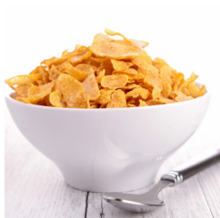
Cereal 18 oz. box