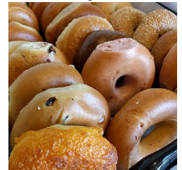
Wheat Bagel 1 - 4 oz. bagel