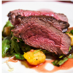
Top Sirloin Steak 1 lb.