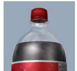
Soda 2 liters