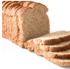
Bread 2 lbs.