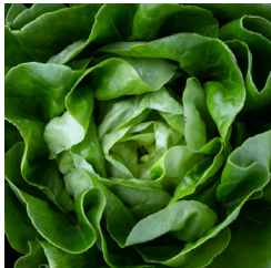
Lettuce 1 lb.