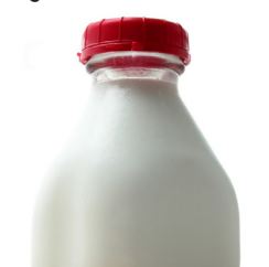
Milk 1 gallon, fat free