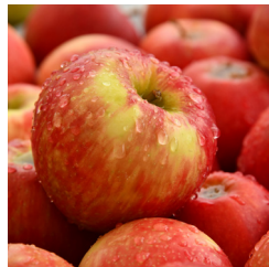
Fresh Apples 1 lb.