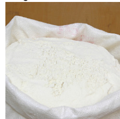
Flour King Arthur, 5 lbs.