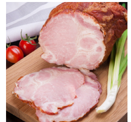
Boneless Ham 1 lb.