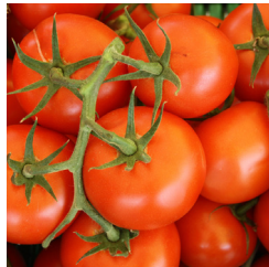
Tomatoes 1 lb.