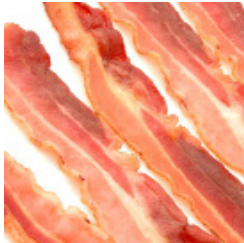
Bacon 1 lb.

Did you know that farmers and ranchers receive only 14.3* cents of every food dollar that consumers spend? According to the USDA, off farm costs including marketing, processing, wholesaling, distribution and retailing account for more than 80 cents of every food dollar spent in the United States.